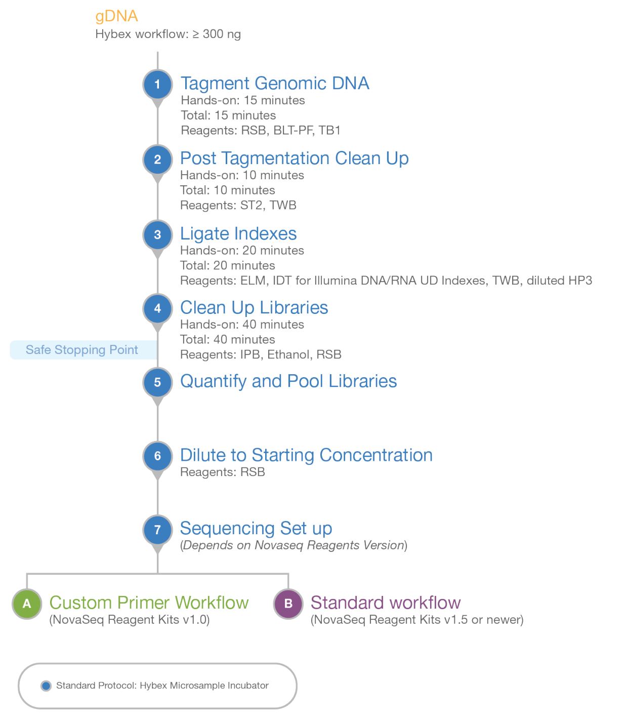
Figure 3 Illumina DNA PCR-Free Library Prep Workflow

The following diagram illustrates the Illumina DNA PCR-Free Library Prep Hybex workflow, with inputs of ≥300 ng DNA.