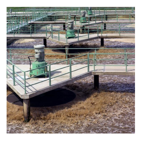
A sewage treatment plant

The search for new microbes for the creation of biofuels and bioremediation is usually carried out with metagenomic approaches. However, evolutionary pressure and manipulation in the laboratory can be very effective in improving newly-discovered candidates.