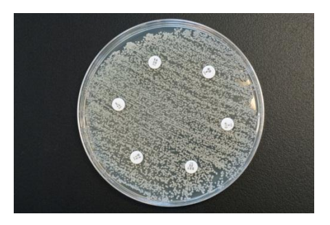
A culture of a multiresistant bacterium. This pathogen is tested for the following antibiotics: VA: vancomycin, RD: rifampicin, CIP: ciprofloxacin, STX: cotrimoxazole, MY: clindamycin, E: erythromycin. 9004039

The development of antibiotic resistance can be considered as a special case of directed evolution. It has been the subject of intense research due to the increasing prevalence of antibiotic resistant strains.