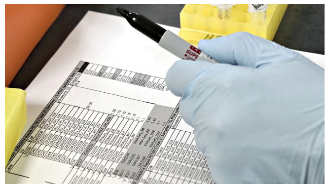
The bioinformatics team calculated that a do-it-yourself solution could consume tens of person years and hundreds of thousands of dollars

They initially considered building a LIMS from scratch to make sure that it would be compatible with the customized downstream analysis tools that the center planned to use. Indeed, one of the major advantages of building an in-house LIMS is that it provides the ultimate