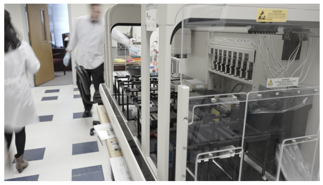
A robust API can do everything from integrate with upstream or downstream tools to automate routine tasks, such as liquid handling robots off pipeline protocol steps.

The University of Washington Northwest Genomics Center originally developed its own LIMS because the available commercial software did not support its specialized needs. However, when it came to scaling from 3 to nearly 20 Illumina sequencing systems, the center didn't have the time necessary to develop a system capable of handling the expanded throughput. "Building made sense at the